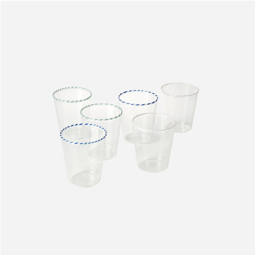
Twist Tumbler, mixed