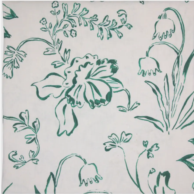
Botanical Print Green & Cream Tablecloth