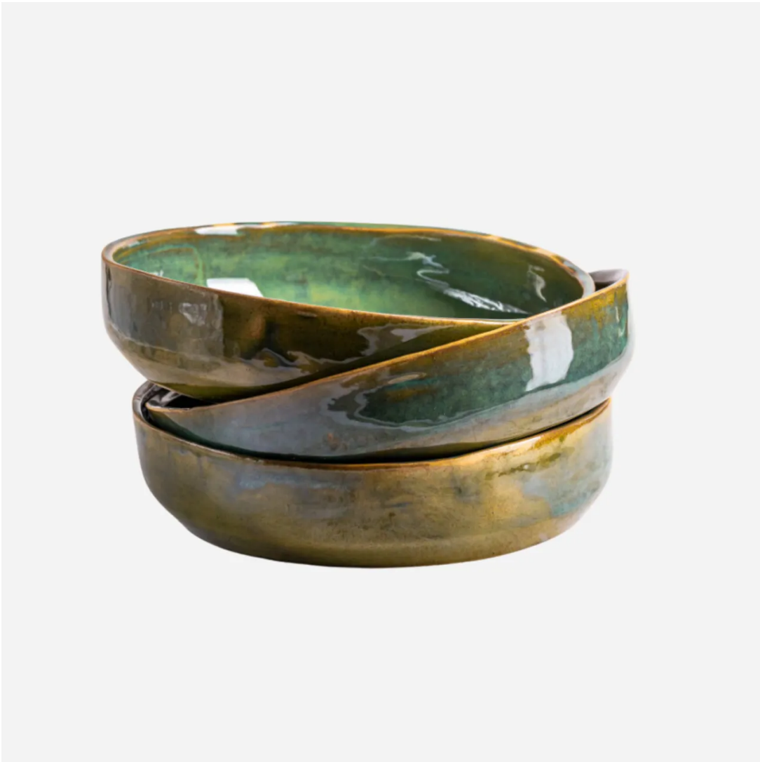
Millfield Serving Bowl