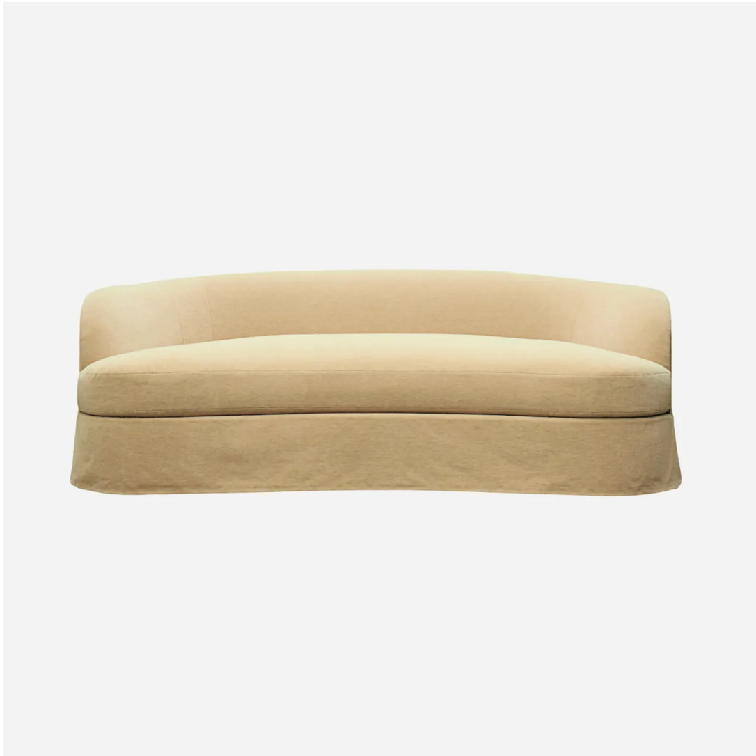
Tor Tailored Sofa, in 'Marci' Mohair