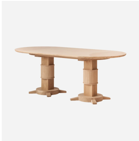
Noughts and Crosses Dining Table