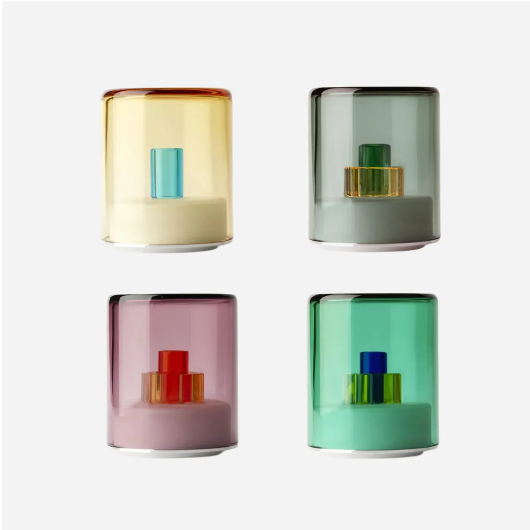
Cordless Table Lamps