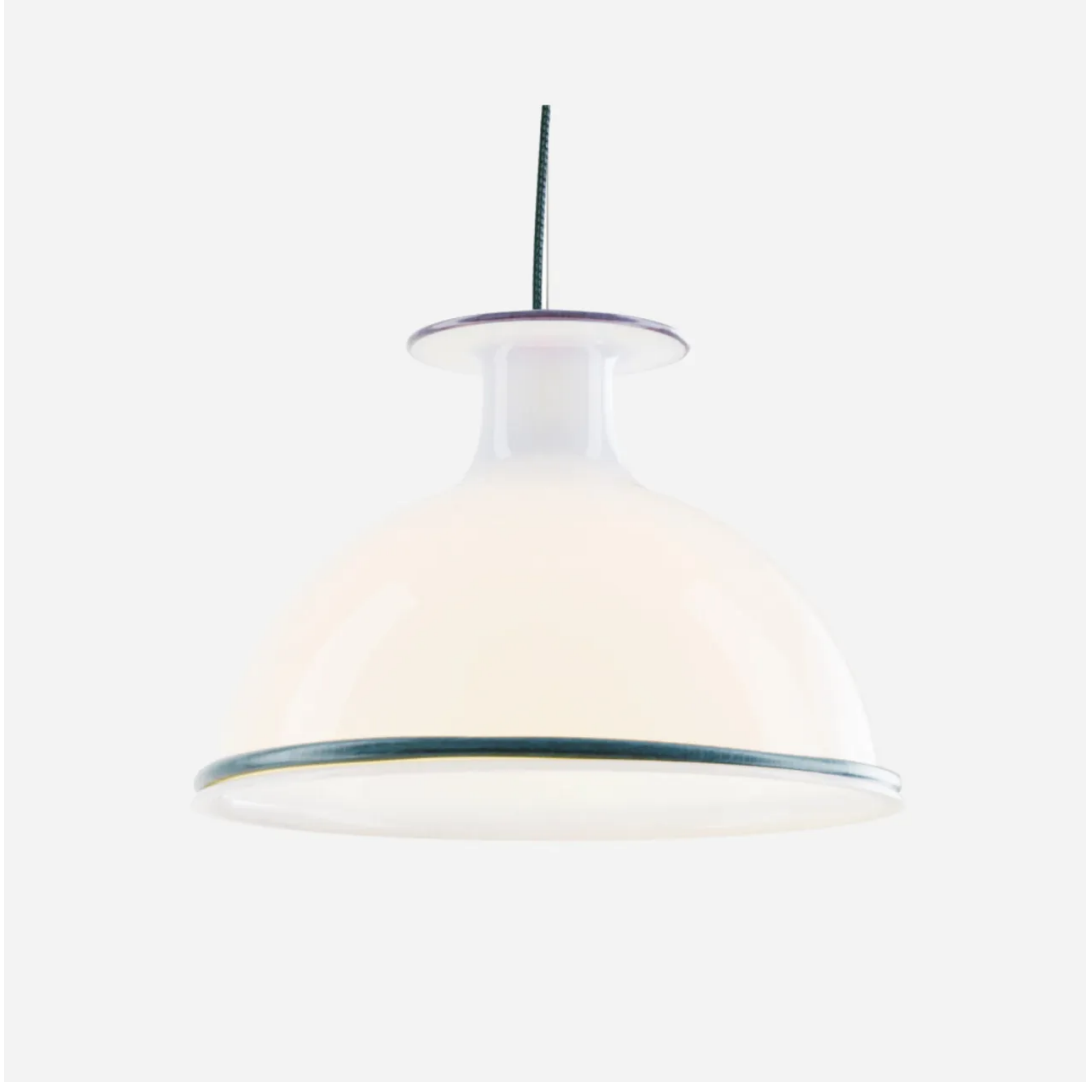
Mark Pendant Light, Established & Sons

Simple furniture with gentle curves is the starting point for a calm scheme. However, some life and energy can come into play with sketchy, botanical textiles and embroidered embellishments.