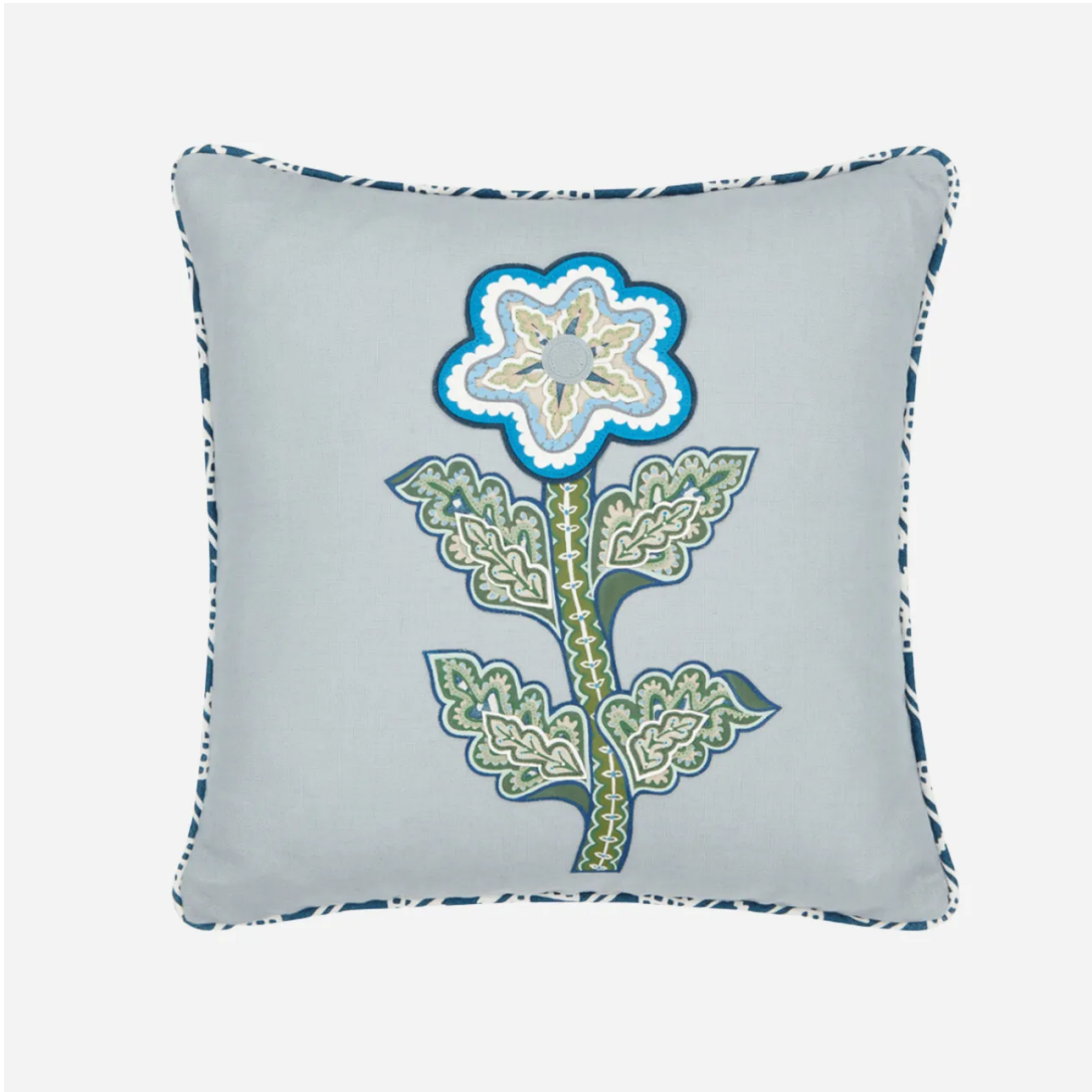
Vasilisa Appliqué Parma Grey Cushion