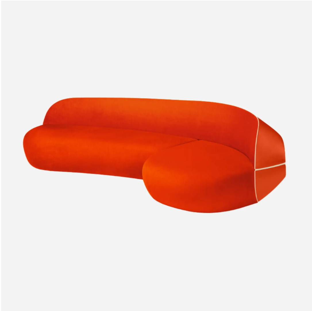
Binda Sofa By Raw Edges

Tortoiseshell, bamboo, tan and green are a classic combination, but given a contemporary twist by modern forms and fluid upholstery. This amazing wall light by Natalia Triantafylli combines traditional hand-built ceramics with 3d-printed elements.