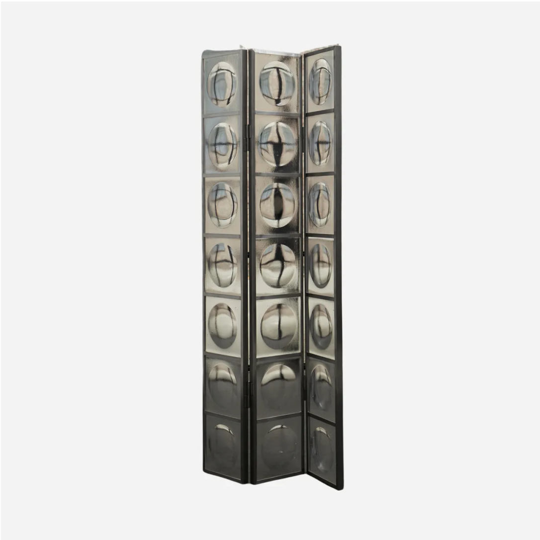
Lens Concertina Privacy Screen