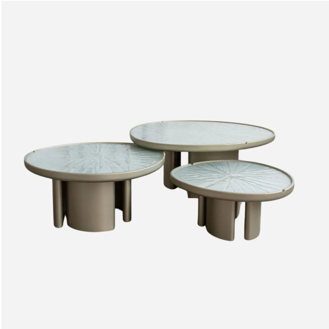
Water Lily Tables