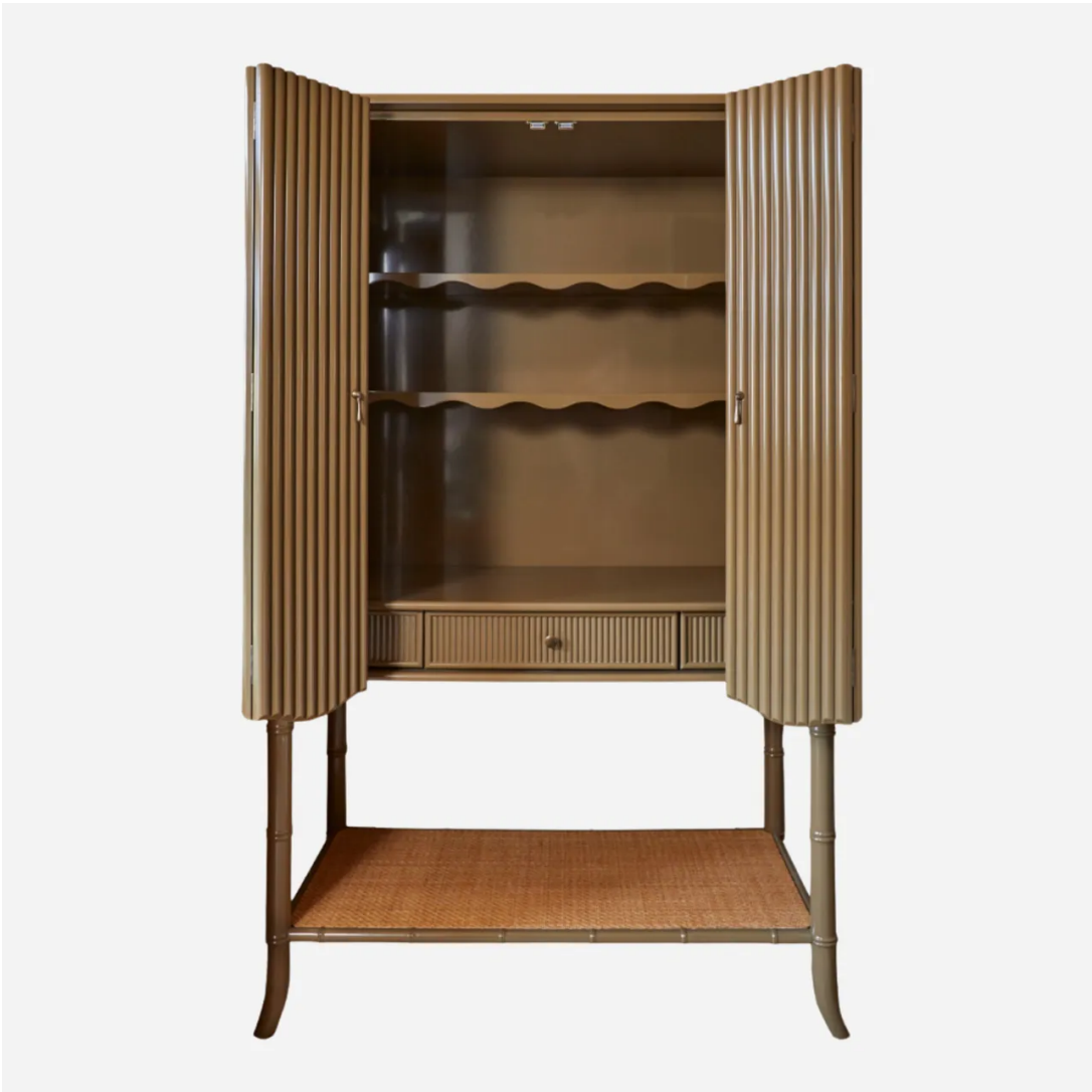
Avalon Bar Cabinet