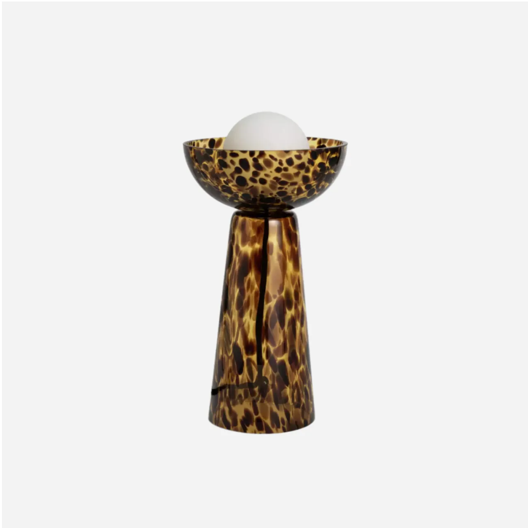
Habitat Tortoise Shell Glass Table Lamp