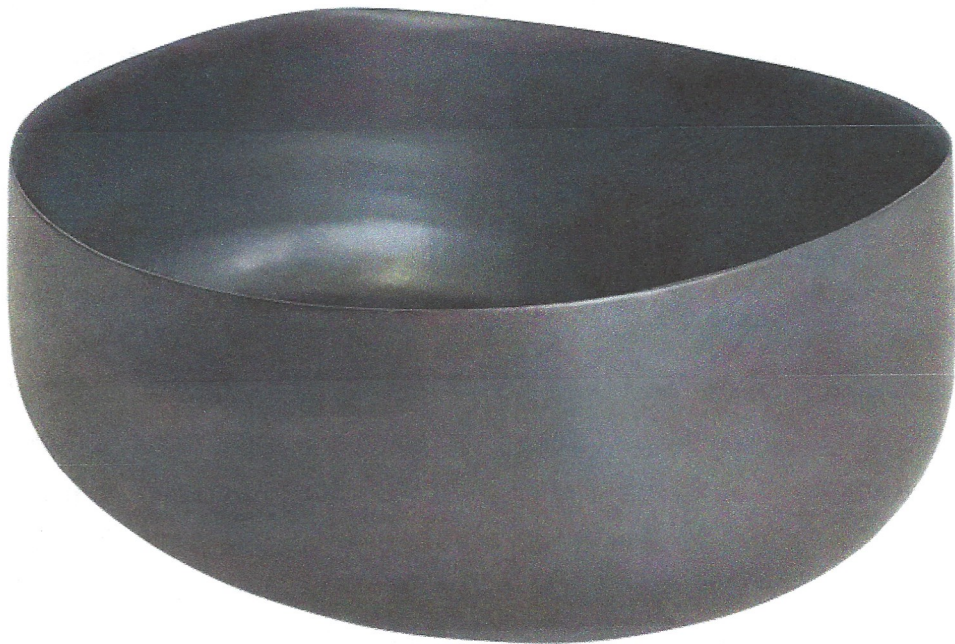
For: Ottchil Wooden Bowl by Sukkeun Kang