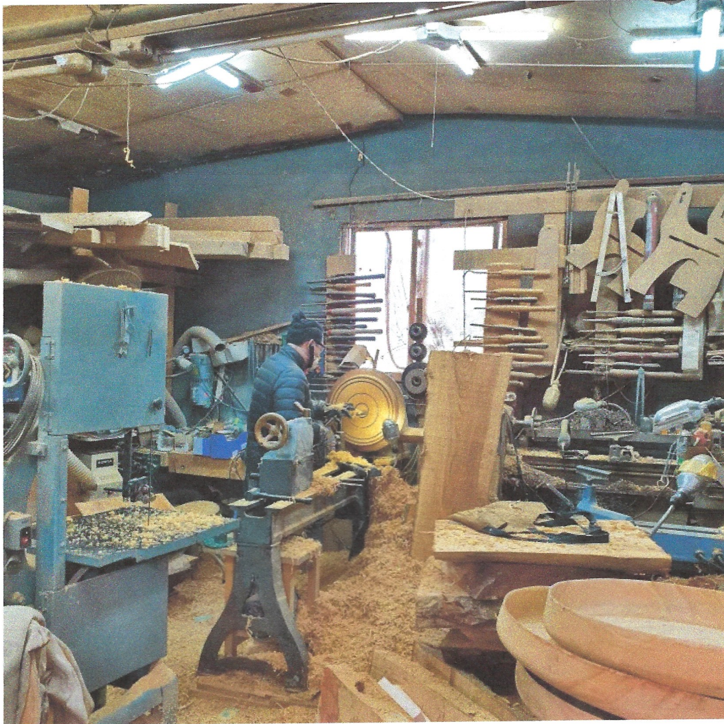
Sukkeun Kang carving wood